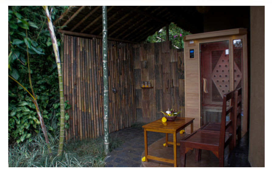
45 mins sessions: IDR 360k for up to 2 guests The treatment should be booked 2 hours in advance. Last booking at 7.00 PM