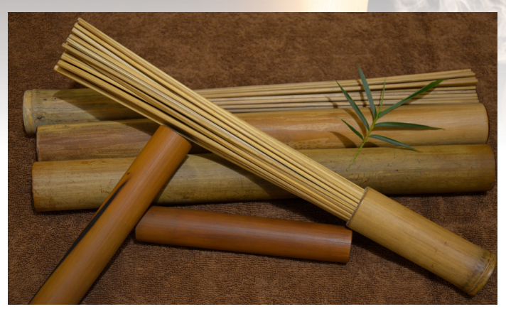
90 mins: IDR 700k