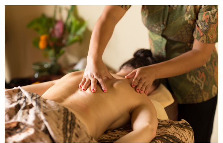
60 mins: IDR 550k